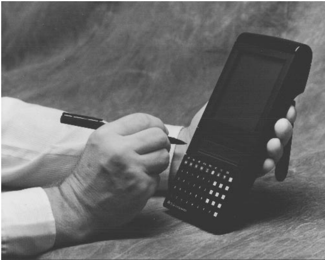
Figure 1. Prototype HHC Platform With Pen Input

The prototype HHC is shown in Figure 1. The processors and I/O devices for implementing HCR are described in the following paragraphs.