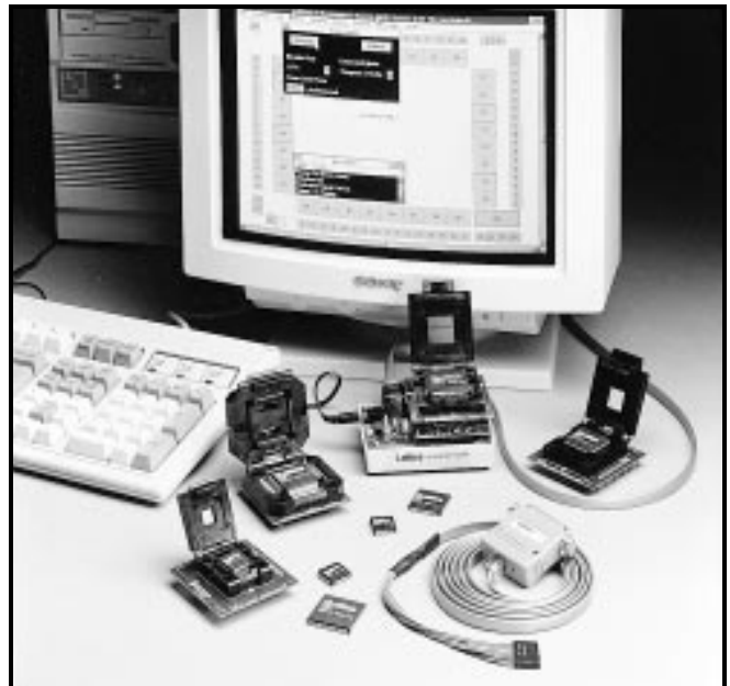
isp Engineering Kit - Model 100

The adapters plug into the UPM base. The adapter provides the appropriate PLCC, PQFP, TQFP, or QFP socket for a particular ispLSI device package.