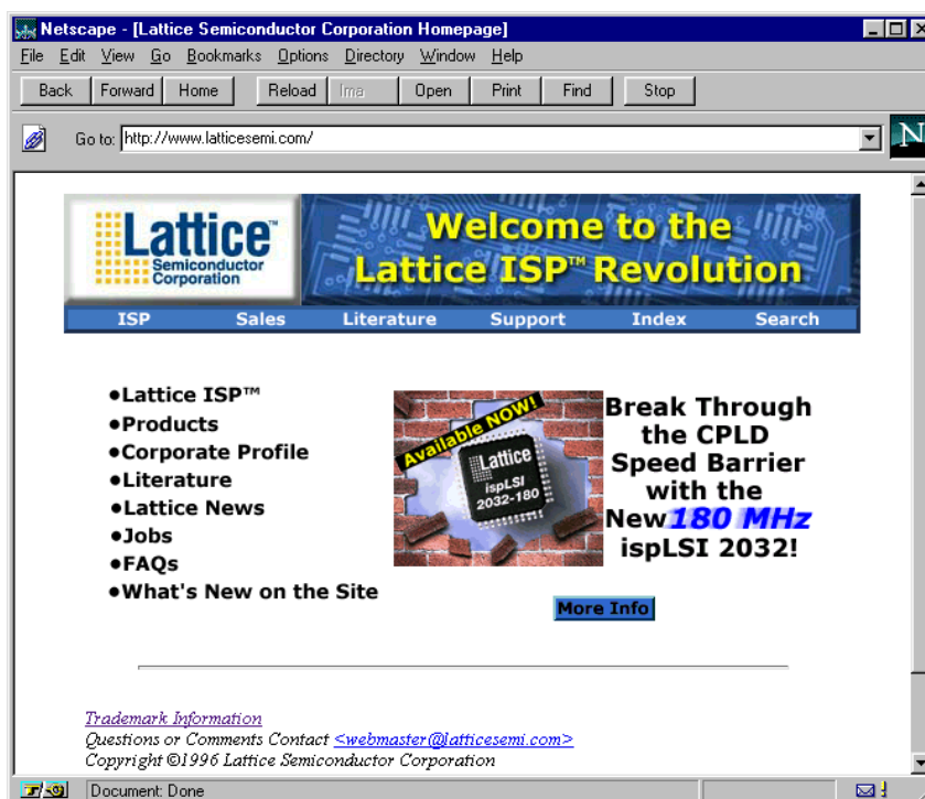
Figure 1. Lattice Semiconductor Home Page