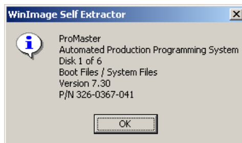
Status window describing disk contents