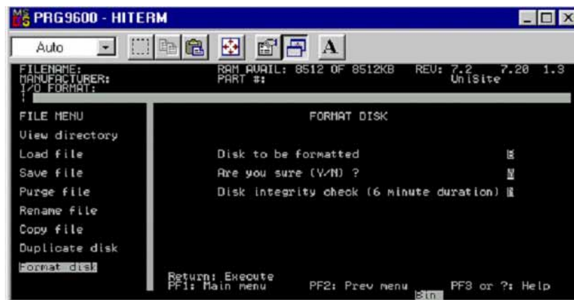
FORMAT DISK screen